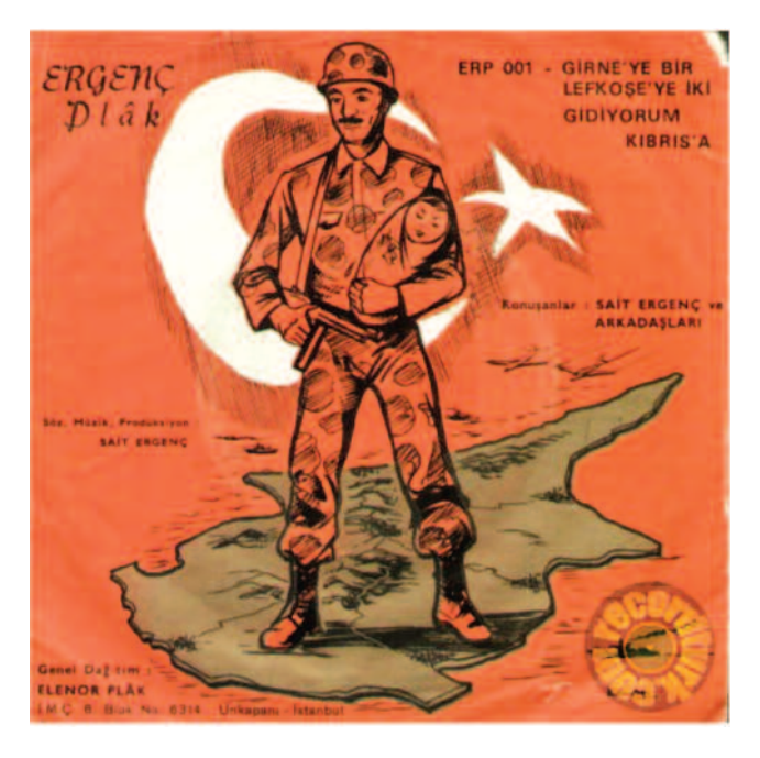
Image 7: Album from 1974, "One for Girne, Two for Lefkoşe, I'm going to Cyprus."