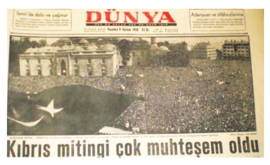
Image 1: Turkish newspaper headline from 9 June 1958 with photo of a Cyprus demonstration in Beyazıt Square, Istanbul.

Indeed, it seems that the more the Turkish government resisted becoming involved in Cyprus's affairs, the more these various mechanisms acted to whip up public opinion. Moreover, these mechanisms played on historical references to Crete, to the Greek invasion of Anatolia in the 1920's, even to the "betrayal" of Greek revolutionary forces at the beginning of the nineteenth century. They portrayed Greeks as bloodthirsty and untrustworthy, and they warned that the Turks should be on their guard.