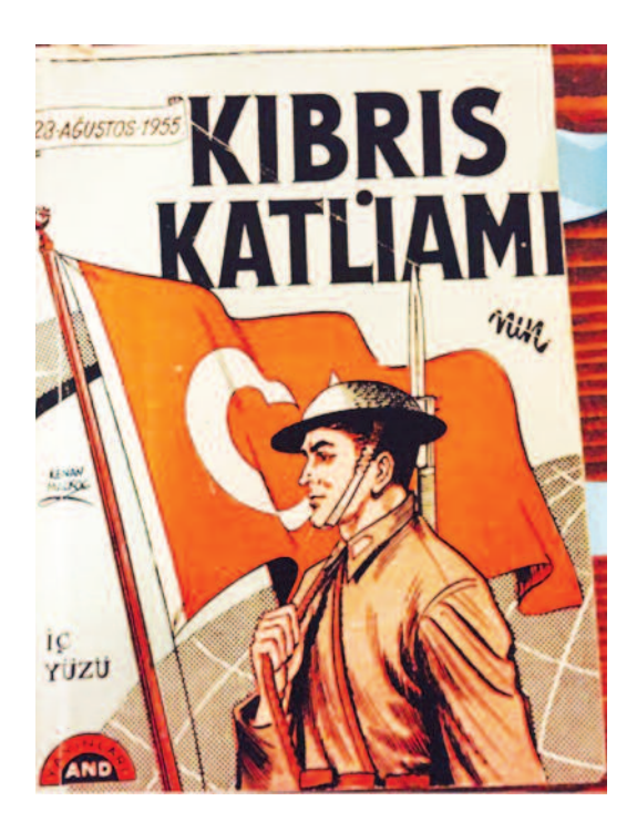
Image 2: Cover of pamphlet published immediately before the events of 6-7 September 1955.

Moreover, the pamphlet refers to the "Great Offensive," the beginning of Mustafa Kemal's military campaign against Greek invading forces, which began on 22 August 1922, in other words in the same month. At that time, the pamphlet declares, the world turned its eyes to the offenses the Greek forces committed against the unarmed population. "But in this day and age it's not acceptable to cut down innocent people whose only fault is that they have settled in that land." <sup>37</sup>