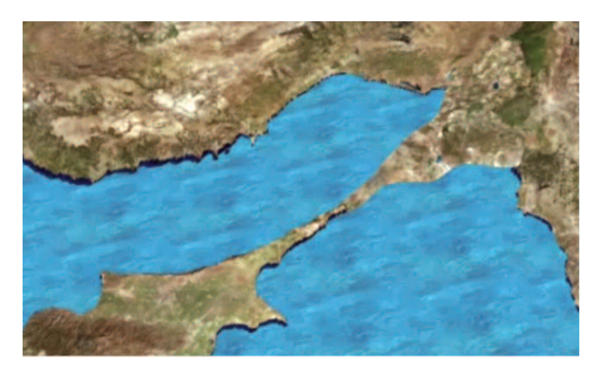
Image 9: Image from a news item dated 28 March 2016, announcing a research project between the TRNC Ministry of Tourism and Gazi University in Turkey intended to demonstrate "both the cultural connection and the territorial movements between Turkey and the TRNC." 65

Cyprus is the Mediterranean's third largest island after Sicily and Sardinia; its location between the Çukurova region, surrounded by the Taurus Mountains, and the Hatay region, surrounded by the Amanos Mountains, demonstrates its unity with these shores. At the same time, because of its dominant position in the Iskenderun Bay, composed of Hatay and the Anatolia coastline, it is in a position to control these territories.<sup>64</sup>