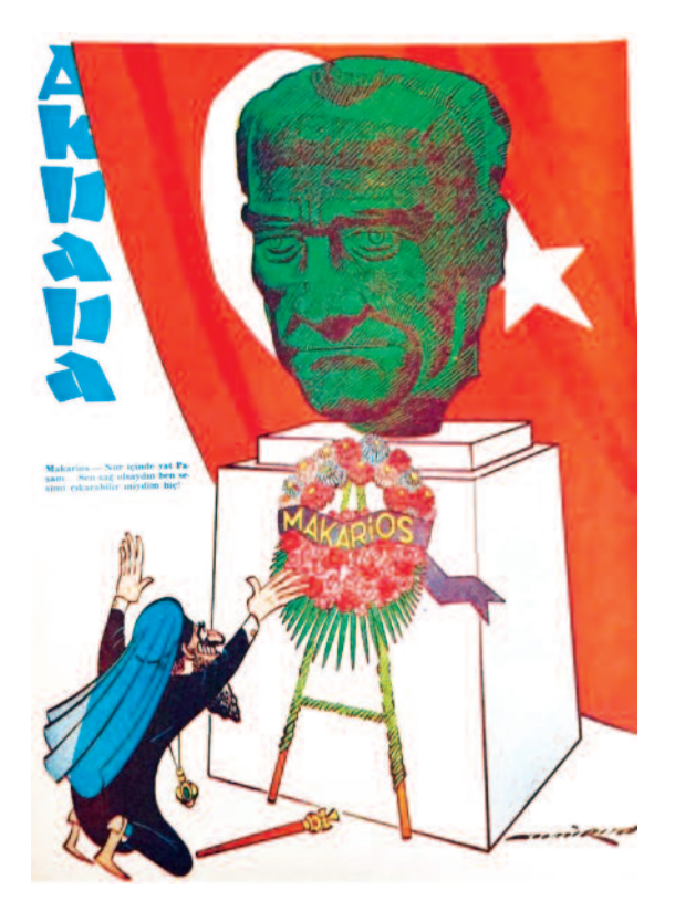
Image 4: Cover of the Turkish humor magazine Akbaba, dated 12 November 1964, showing Cyprus President Makarios putting a wreath on a memorial to Atatürk with the caption, "Rest in light, my pasha.... If you had been alive I never would have been able to make such a fuss!"

During that period, the "national cause" acquired even more urgency, as media reports showed Turkish villages under attack and reported on numbers of the dead and missing. Moreover, a flurry of films based on the Cyprus conflict began to appear after 1964, with titles such as Ten Fearless Men (On Korkusuz Adam) , Cyprus the Volcano (Kibris Volkan) , The Legend of the Rising Fighters ( Şahlanan Mücahitlerin Destani ), The Female Enemy ( Dişi Düşman ), and The Commandoes are Coming ( Komandolar Geliyor ).<sup>43</sup> In the parts of Anatolia not reached by these films, other methods, such as circulating tapes, produced the same result. One woman originally from Kayseri whose son fought in Cyprus in 1974 and who eventually settled in the island explained to us how she first heard of Cyprus from such a circulating tape, in which a Turkish Cypriot woman described an attack on her village. Although she still arrived in 1974 knowing little about the island, she says that she had in mind "brothers" who were under attack and needed the protection of their "mother."