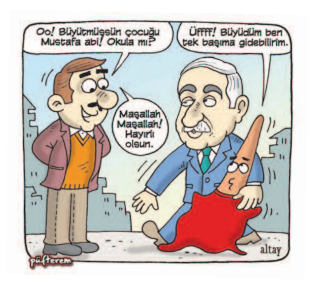
Image 10: The man on the left remarks to Mustafa Akıncı, "Oo! You've brought the child up, Mustafa Abi! Are you taking him to school!" The child in the shape of Cyprus exclaims, Öff! I've grown up! I can go on my own." The man replies, "Wonderful, wonderful! Good fortune to you."

head with Turkish President Erdoğan. The latter moderated his language, referring to Turkish Cypriots as "brothers," but tension between the two leaders remains. While the caricature below shows the amusement of some in Turkey at the insistence that Turkish Cypriots need to be treated as adults rather than children, there is nevertheless a sense that Turkish Cypriot leaders will resist attempts to shape their citizens in the image of the Turkish public.